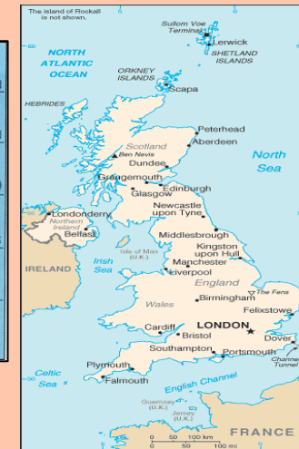
The United Kingdom