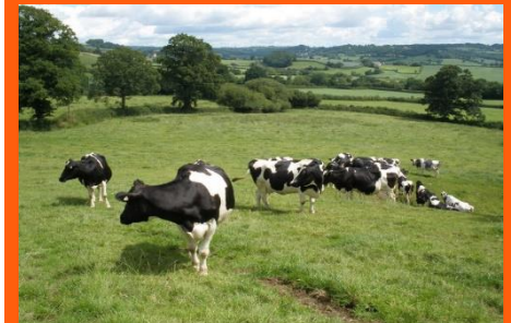
Devon, The United Kingdom