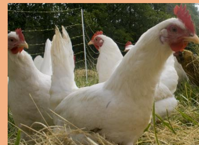
Free range chickens